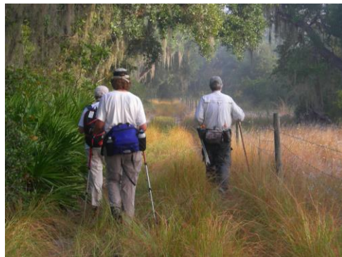
Recreation at Fisheating Creek, FL

Increasingly, chambers of commerce and economic development associations in every western state are using the region's national parks, monuments, wilderness areas and other public lands as a tool to lure companies to relocate. High-wage services industries also are using the West's national parks, monuments, wilderness areas and other public lands as a tool to recruit and retain innovative, high-performing talent.