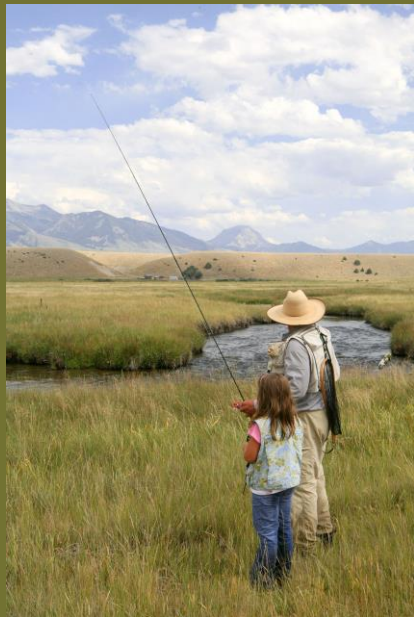
Recreation at Odell Creek, MT

In 2015, 443 million recreational visits to Department of the Interior (DOI) managed lands contributed over $45 billion in economic activity and supported more than 396,000 jobs – many in rural areas. Use of water, timber and other resources produced from Federal lands supported about 405,600 jobs and $51.4 billion in economic activity in 2015. The $214 million that DOI spent on land acquisition in 2010 created an estimated $442 million in economic activity—more than doubling the return on investment-- and about 3,000 jobs.