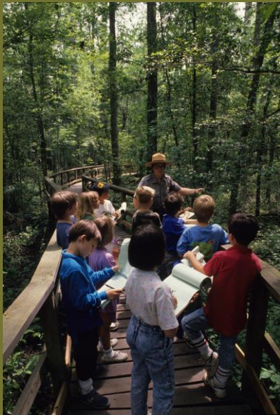
School Group at Congaree NP, SC

Even while providing all these public benefits, LWCF is not funded by taxpayer dollars. To keep pace with intense development pressures and growth that threaten the few remaining open spaces we have left in this country, the LWCF Act of 1965 made a commitment to the American public that a small portion of revenues from offshore drilling paid by oil companies would go to conservation and outdoor recreation programs. This continued investment is crucial to maintaining public access and close-to home recreation for all Americans as our population and urban base inexorably grows.